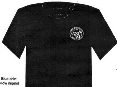
Navy Blue shirt with Yellow imprint