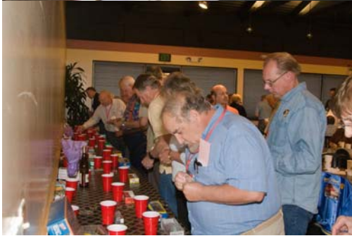
Chinese Auction Mayhem