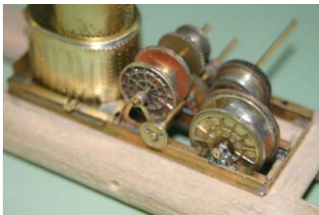
Gears, Wire Reels, and Crankshaft being test fitted. Still a lot of part clean up to do at this point.