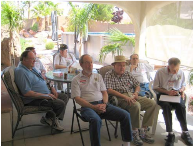
In Photo: Left to Right