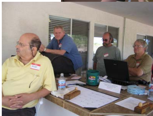
In Photo Left to Right: