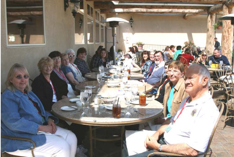
A very 'Happy' Group of 'Winos'