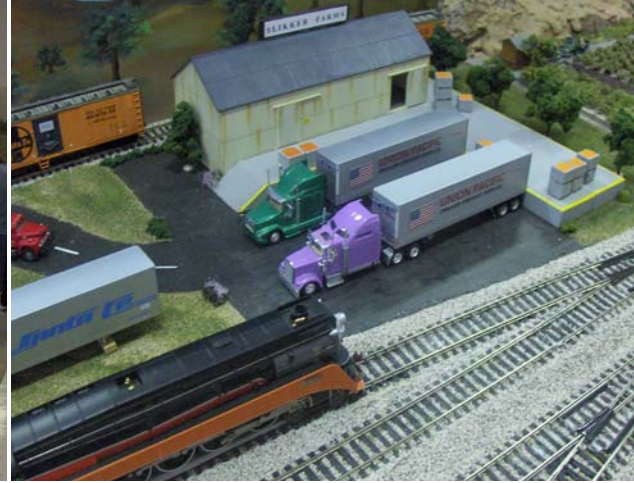
The Pahrump Valley Modular Railroad Club had a very nice layout on display.