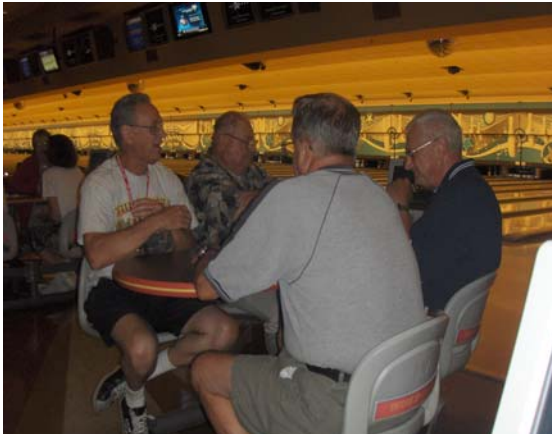
Waiting my turn at Bowling for Trains