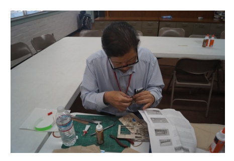
Make and take clinic