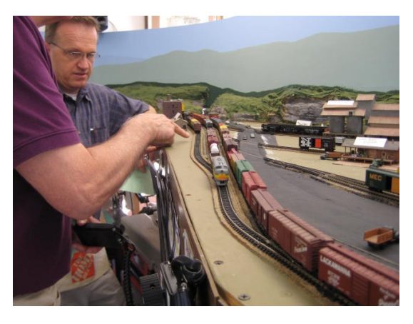
Delta Ops 11/2/2012