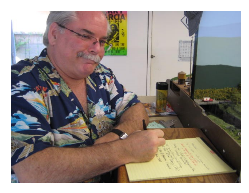
Making Notes on the first Operating Session of the NYOW

If you are already interested in Operations, I recommend that you do three things immediately: 1) join the Operations Special Interest Group (OpSIG); 2) buy / borrow and read the OpSIG book "A Compendium of Model Railroad Operations" and 3) find layouts to operate on. This last is the toughest, because most operations sessions are overbooked. One way to get on the "Crew List Invitation" is to find someone who has an operating layout, and offer to help on the layout, doing something you enjoy and are good at, ideally something the owner dislikes doing. The layout owner will appreciate your offer and effort.