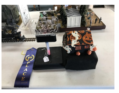
Trick or Treat First Place Popular Choice Annette Palmer