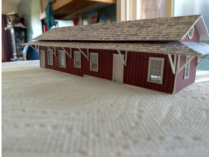
Figure 1: Mock Up of Mound House Depot

I'm a Virginia and Truckee Railroad nut. So when the Narrow Gauge and Shortline Gazette published plans for the joint V&T/Carson and Colorado Passenger station I had to build it. In fact I did it twice. Once as a mockup and the second time for real. (See Figure 1)