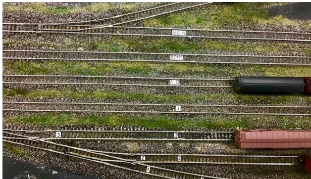
Yard Tracks, Classification Tracks Clearly Labeled

In addition to labeling key locations, yard limits, yard tracks, and customer spurs, it’s a good idea to label the customer structures themselves, either with readable signs as part of the modeled structure, or as shown here, with cardstock signs on the roofs or on the ground (for the team track). An additional level of labeling would be appropriate if you want to have road crews switch customer traffic to specific loading doors.