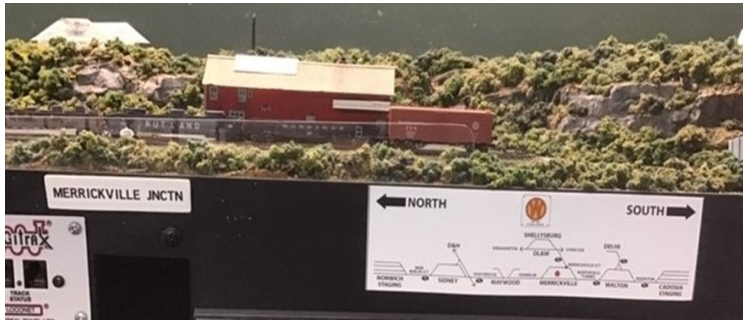
NYOW Schematic: Overhead and Fascia Mounted

In addition to the fascia mounted information, I also label each track between the ties. The picture below is the same location, Merrickville Junction, but looking down on the trackwork. (Unfortunately, the label for the Siding is a not readable.) Notice the change in ballast and tie color on the DL&W.