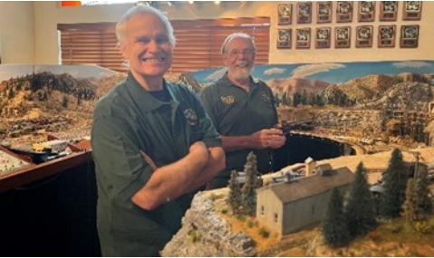
Cajon and PSR members began arriving at 10 am and immediately began to look over the layout, run a train or find someone to talk trains with.