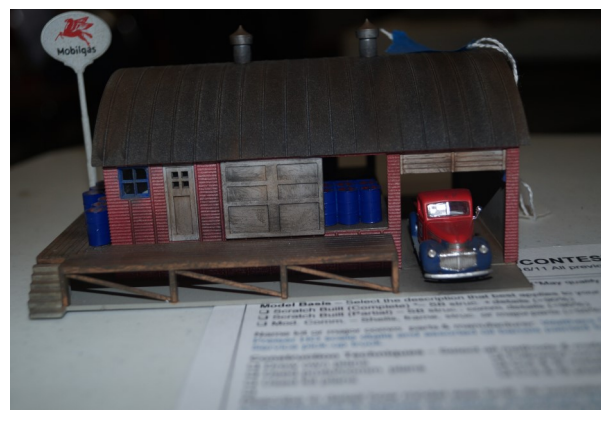
Mobil Oil Structures On Line—2nd Place 3rd Place Popular Choice Merit Award