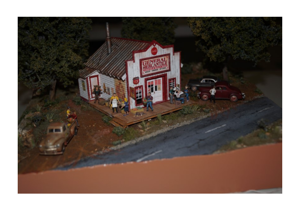
Structures On Line Tim Steinmeier Structures On Line —1st Place Popular Choice—2nd Place Merit Award