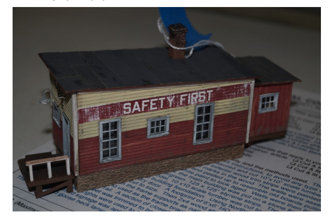
Yard Office Structures On Line—3rd Place Ist Place Popular Choice Merit Award