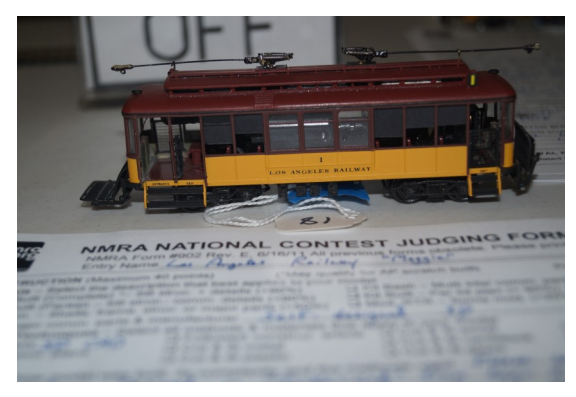
LA Railway "Maggie" Merit Award 1st Place - Traction, 2nd Place Popular Choice