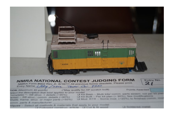
Lary/Tower Car Merit Award Honorable Mention - Traction