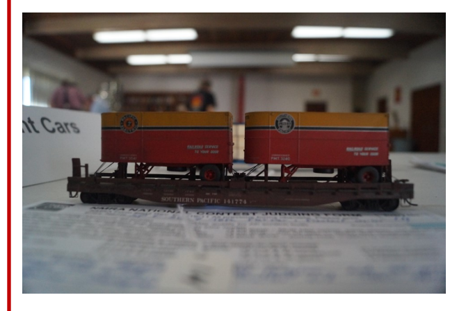
SP F-50-7 TOFC Flat AR & Freuhuef Trailers 1st in Freight car, 2nd in popular choice, Merit Award