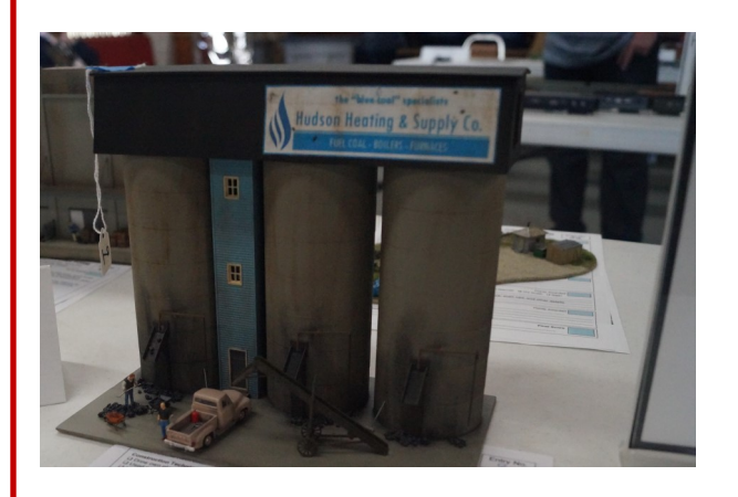
Hudson Heating & Coaling Elevator Structures On Line—2nd Place Popular Choice—1st Place Merit Award