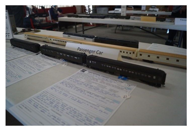
Three SP Passenger Cars All merit Awards Ist Place in Passenger Cars, 1st or 2nd in Popular vote