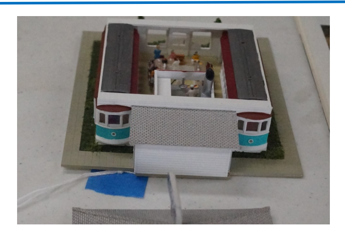
Blue Plate Special—William Marececk Best in Show—Structures Offline Merit Award, 1st in Popular Choice