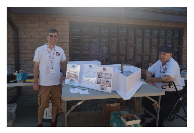
New Layout for the LA Port Railway—LAMRS