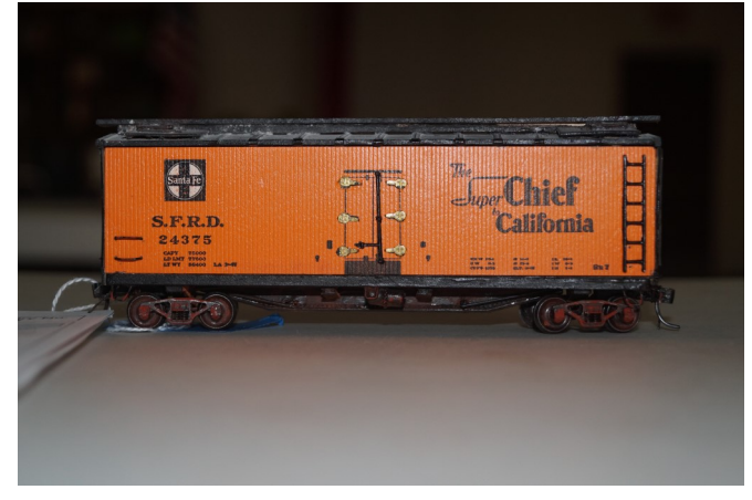
Freight Car - SFPD Wooden Reefer Morrie Fleishman Popular Choice—1st Place Freight Car—3rd Place