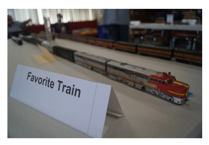
Favorate Train - Santa Fe Grand Canyon Arie Korporaal Popular Choice—1st Place