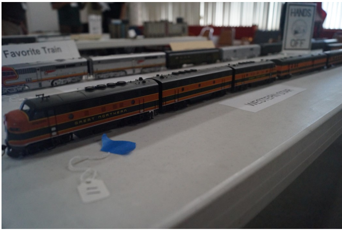
Favorate Train - Great Northern Western Star Jerry Duncan Popular Choice—2nd Place