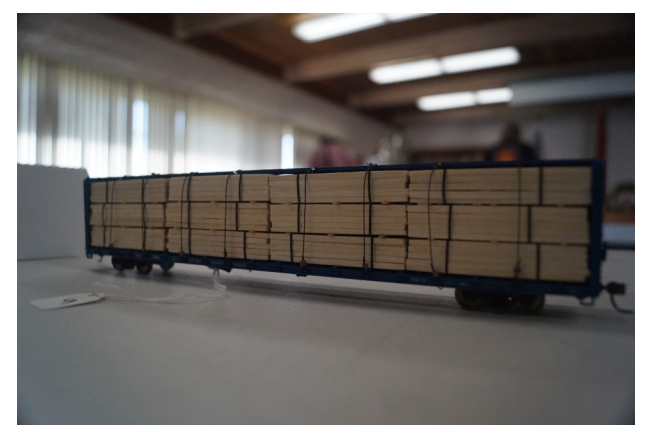
Freight Car—Center Sill Flat Car Don Erickson Popular Choice—3rd Place