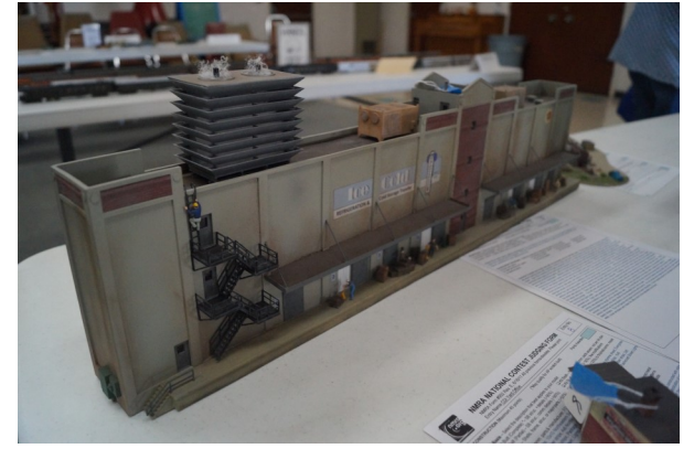
Ice Cold Refrigeration Storage Transfer Structures On Line—1st Place Merit Award