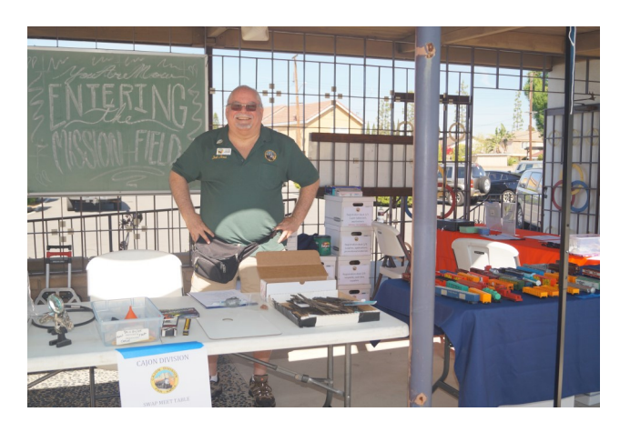
Registration and Cajon Swap Meet Table