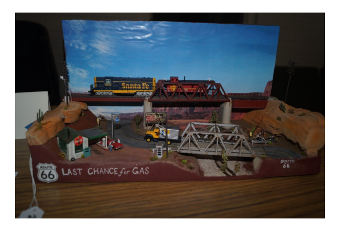
Structures Off Line—Tom Stumpf Structures On Line —1st Place Popular Choice—1st Place, Merit Award