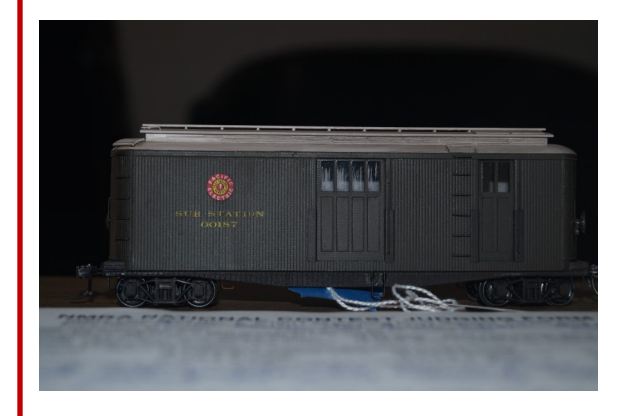
Pacific Electric NOW Portable Substation Non-Revenue—1st Popular Vote