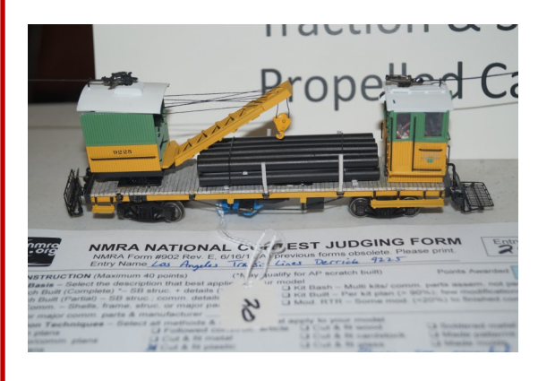
LA Transit Derrick Car 9225 Merit Award 2nd Place - Traction, 1st Place Popular Choice