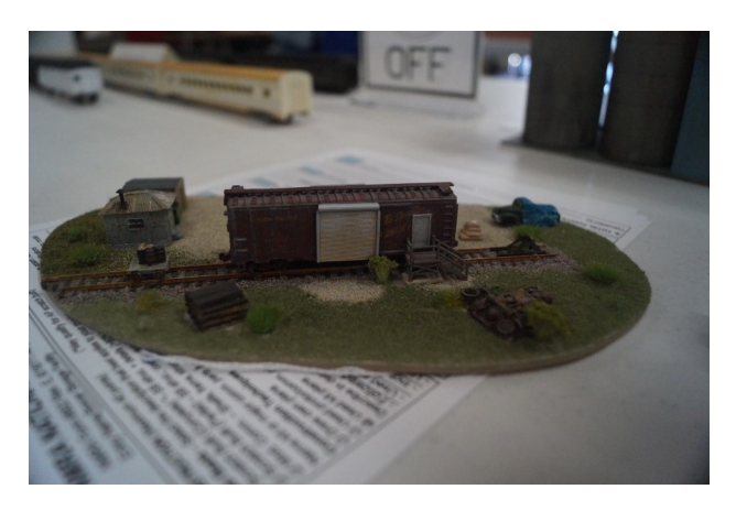
Box Car Storage Facility Structures On Line Popular Choice—1st Place