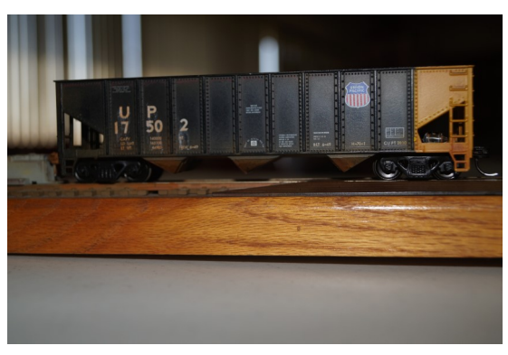
Freight Car—Coal Car Brian Hunnell Freight Car—2nd Place Merit Award