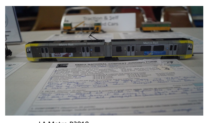
LA Metro P3010 Merit Award 3rd Place - Traction, 3rd Place Popular