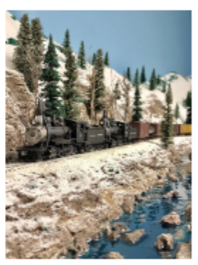
Model Showcase Room