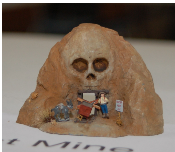
1st Place, Lost Mine