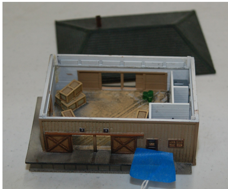
Acme Transship Warehouse