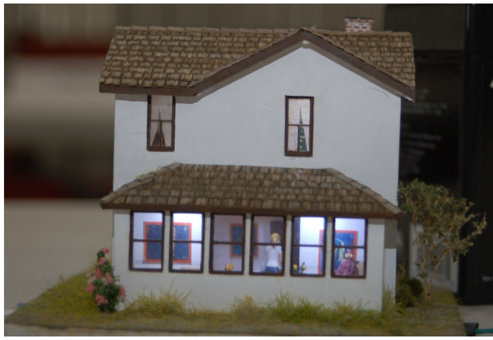
Oyster Bay House